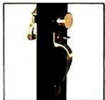
Similar Installation for most panic locks