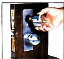
Replace Cylinder with Cor-Kit