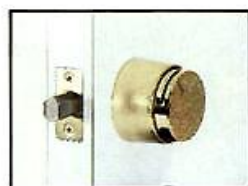
Secure from inside door