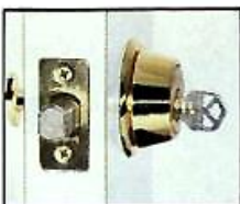
Original single Cylinder Deadbolt