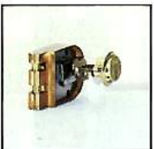
Original Rim Lock