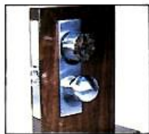
Lock in Place