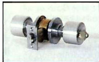
Lock on Cor-Kit