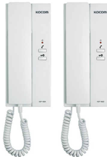
KDP-605 Combine door phone