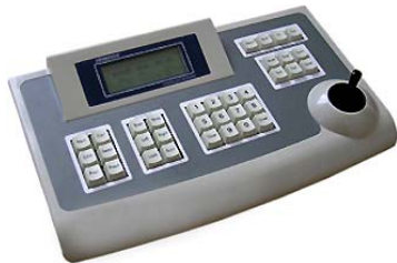
Model: Securitex MPKB-A1.256CH

The Securitex Multi-protocol keyboard can control up to 256 Pelco P and Pelco D protocol PTZ camera. The super wide screen c/w 4 lines display, 2 dimension joystick with patrol path setting and LCD back light. Input voltage 12VDC controlling 1024 Channels. Communication RS-485 and power consumption 8W. This keyboard works extremely well with: