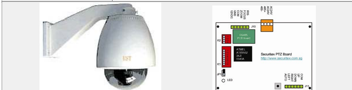
Securitex-CNB-A1263PL camera in Pan/tilt Dome housing c/w Multi-protocol telemetry board. This PTZ camera is gear driven and do not use belt.

Securitex Electronic Systems Engineering Block 9010 Tampines St 93 #04-145 Tampines Industrial Park A Singapore 528844 http://www.securitex.com.sg