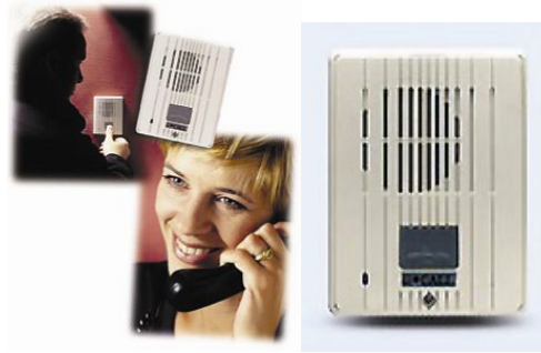
Model SEPS 01A

The Securitex E Phone Solo provides the latest in convenient door communications for any single residential or commercial intercom application. Using the Securitex E Phone Solo is easy. When you hear the distinctive ring you simply pick up any phone and you are automatically connected to the door. The unit is compatible with cordless phones to allow you to answer the door from anywhere in your house or even outside.