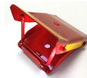
Back view Back view