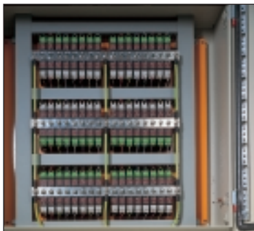
Three rows of protectors, inside a control cabinet, each installed on a CME 16 combined mounting and earthing kit.

Derivatives of these protectors are available ready-boxed to IP66, for use in damp or dirty environments. PCB mount versions are also available. If your system requires a protector with a very low resistance or higher current, use the E & H Series. Also use the E Series for systems needing a higher bandwidth. A protector for 3-wire RTD applications (ESP RTD) is available, as are space saving protectors (Q Series). The KT and TN Series' are additional protectors specifically for telephone lines. The KS Series are protectors for data and signal lines on an LSA-PLUS module.