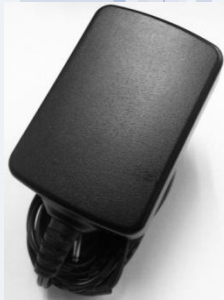
5VDC 2500mA for Charging MD18 Man down Transmitter