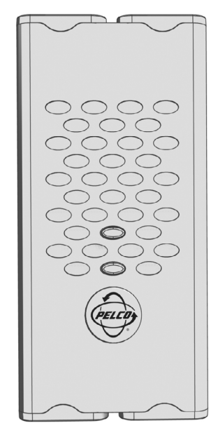
Figure 1. RK5PWR-120 Power Supply